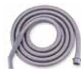
5M/16.4ft Suction hose