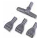
3 adjustable floor nozzles (2, 5, 10mm)