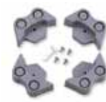
Feet / pipe holder