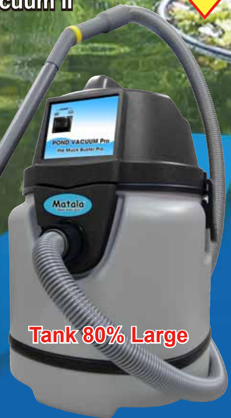
Tank 80% Large