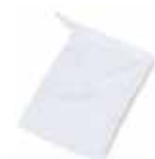
Sludge collection bag