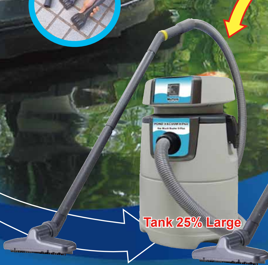
Tank 25% Large