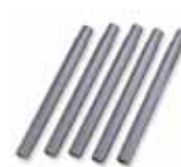
5 Extension tubes