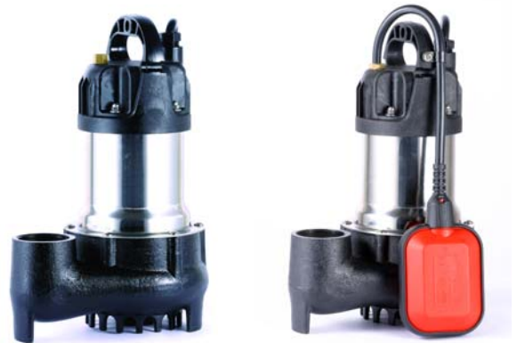
Float switch is option.